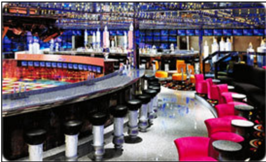
White Head Dance Club is where the action is! Show off your moves and make new friends in the process.