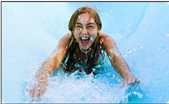
Slide and glide on the Carnival Glory fun-ified Twister Waterslide. It's three decks high of twisting and turning water mania for everyone!